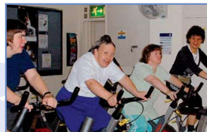
50+ Recreational Sessions