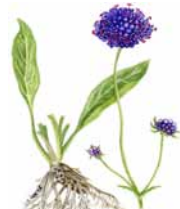
Devil's bit Scabious

Tell us if you see any of these Bracknell Biodiversity Action Plan species whilst out in the town. Send you records to biodiversity@bracknellforest.gov.uk or post to the Biodiversity Officer, Bracknell Forest Borough Council, Market Street, Bracknell, RG12 1JD.