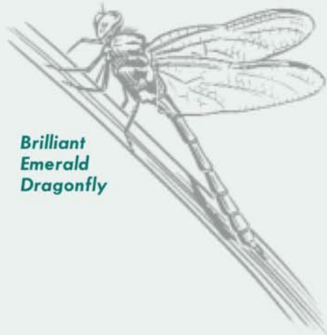
Brilliant Emerald Dragonfly

Heather and Cross-Leaved Heath, in the forest clearings. Oak, Mountain Ash, Willow and Silver Birch are also to be found here, and the Alder trees are a favourite haunt of wintering migrant birds such as Siskins and Redpolls which feed on the seeds.