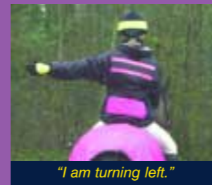
"I am turning left."

Riders should signal their intentions but drivers should be aware that horses are unpredictable and a rider on a young or frightened horse may have their hands full.