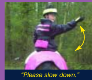
"Please slow down."