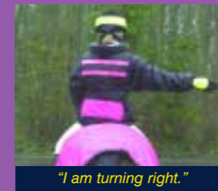
"I am turning right."