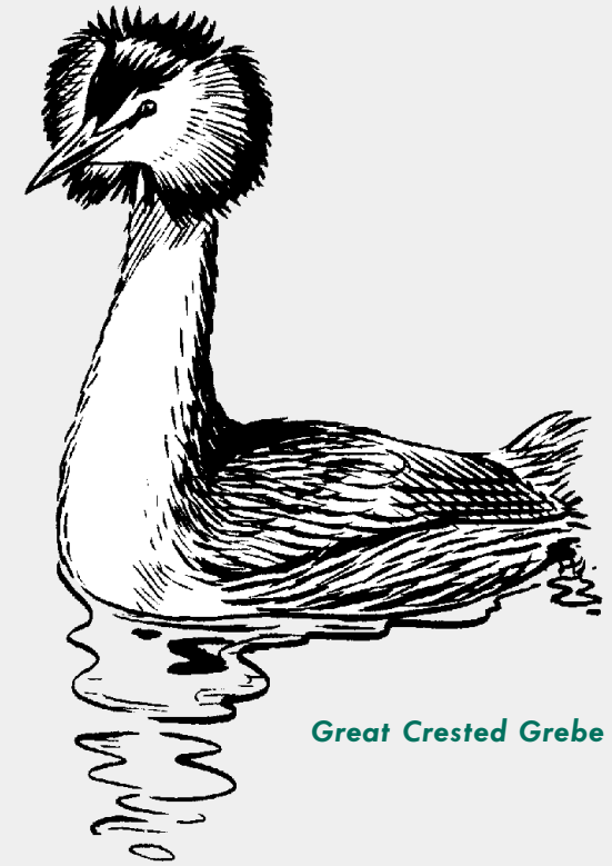
Great Crested Grebe

Site surveys carried out at Horseshoe Lake in recent years have confirmed that the site is home to a wide variety of birds, including winter visitors and breeding