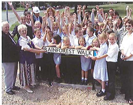
Students from Fox Hill Primary School re-named Rainforest Walk