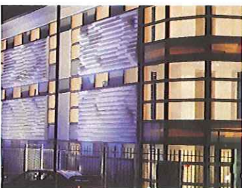
'Air Wave' acrylic and light wall, 2004, Esther Rolinson Detail of 'Air Wave' acrylic and light wall, 2004, Esther Rolinson