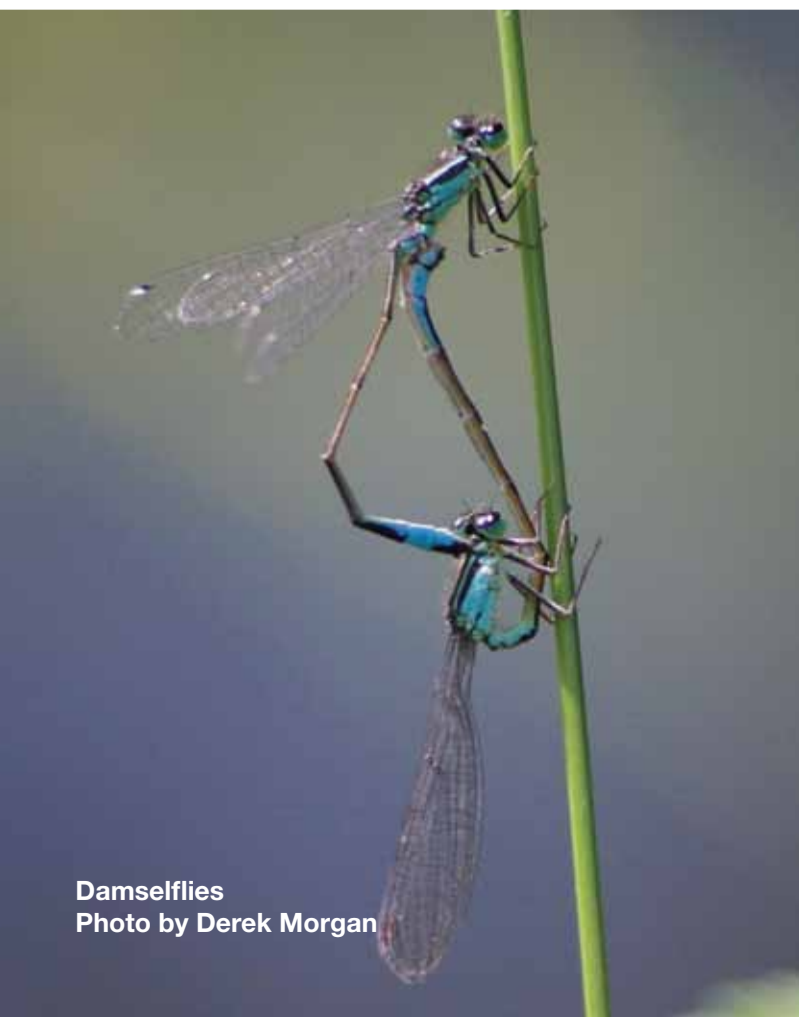
Damselflies

Sandhurst Memorial Park began in 1949 when 2.4 hectares of land known as Brookside Field was purchased by Sandhurst Parish Council to provide a public recreation ground for residents. Successive parish/town councils have gained the rights over adjacent farm and woodlands to make the Memorial Park what it is today.