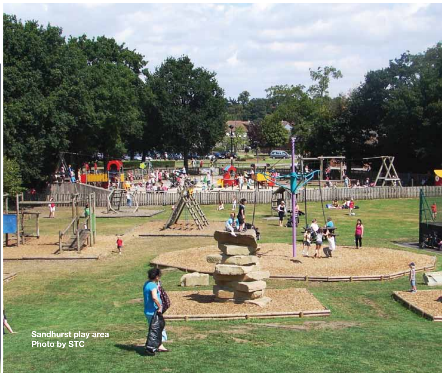
Sandhurst play area

Information points are located throughout the site. These include details of organisations with permanent facilities at the park, an events board, information sign posts to help visitors find their way around and a lectern-style interpretation board.