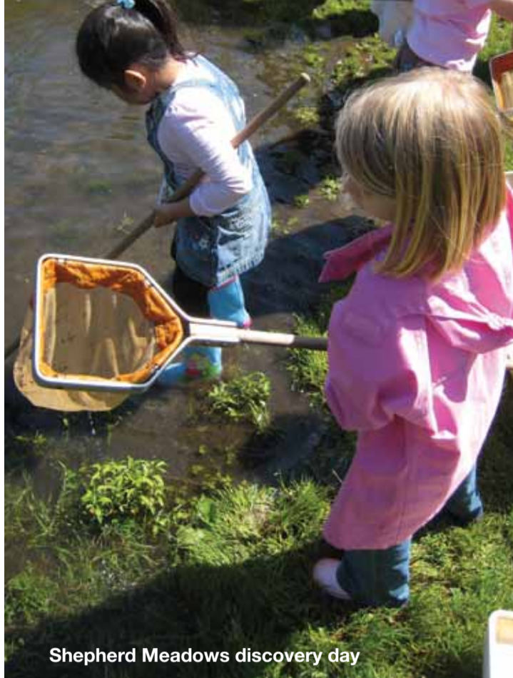
Shepherd Meadows discovery day