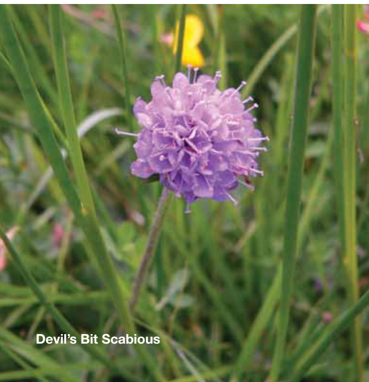
Devil's Bit Scabious

By car - car parks for both the Memorial Park and Shepherd Meadows are located off the A321 (Marshall Road) in Sandhurst GU47 0FH. These include disabled parking bays.