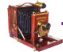
Applicant takes photo