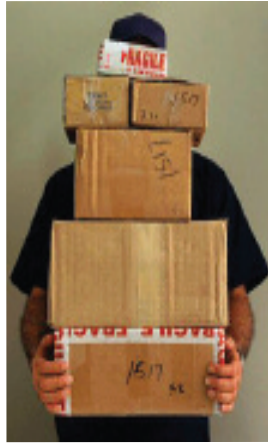
Send to bureau