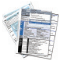
Manual form filling