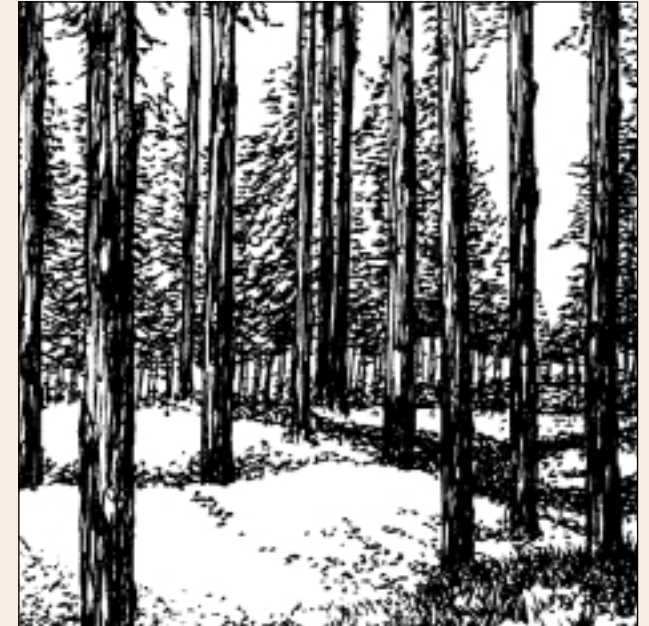
One of the 1792 redoubts, today

Fears of a French invasion in the late 1700s caused the Army to use the heathland around Caesar's Camp for exercises, including constructing redoubts (earthwork refuges) that can still be seen today.