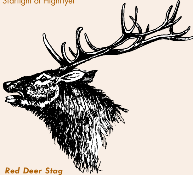
Red Deer Stag

Hunting was the pastime of Kings and Queens. By the 1300s the most knightly form of hunting was chasing male Fallow deer. In time these were replaced by Red deer, still seen in the Forest today. Henry VIII was a very keen huntsman as was Elizabeth I. She coursed with greyhounds and killed her own stags with a crossbow. Queen Anne drove herself in a one-horse chaise when hunting. The sport of chasing with horses, the Royal Buckhounds and a horn continued until 1901. Stags who gave good sport might be rewarded by being saved and well-known stags had pet names such as Moonshine, Starlight or Highflyer