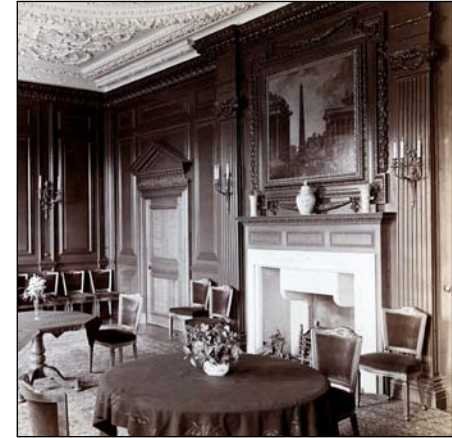
Exhibition figure 9 (detail)