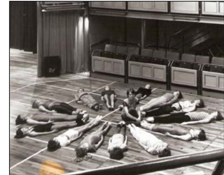
Rehearsals at the Wilde Theatre.

Following the success of the theatre the council gave the go-ahead for Phase II of the works in 1988 and 1989. These consisted of a new art gallery, dance studio, bar extension and additional dressing room, rehearsal and storage space. The Bracknell Gallery opened in 1991, offering a busy programme of contemporary fine art and craft exhibitions with many internationally acknowledged artists. 38