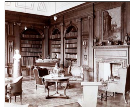
Exhibition figure 11 (detail)