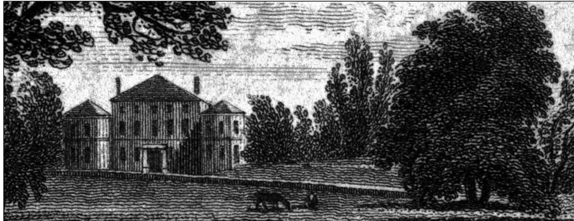
Figure numbers in the text refer to the numbering of images in the exhibition.

Over the years a successive number of owners, including nobility, a prime minister, the BBC and now an arts centre, have all made their mark on the building. These links with the past are particularly important in the context of a new town where any connection with history is at a premium. 1