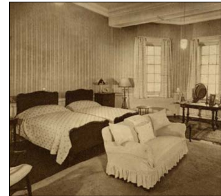
Exhibition figure 13 (detail)

Ideal Home (1948) May, p 45. Collection.