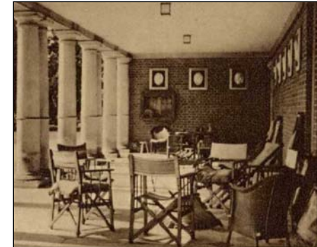
Exhibition figure 12 (detail)

South Hill Park then became part of a group of properties to provide services in the event of a national emergency. Its function was to operate as the European Services section of the BBC and for this reason plans were drawn up for a control room, four studios and recording areas in the house. There were also plans for new buildings in the grounds close to