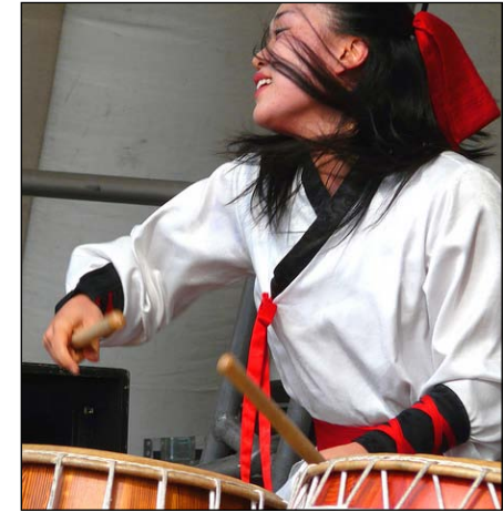
Korean band Dulsori at the 2009 Big Day Out summer festival held at South Hill Park.

After its long and intriguing history, South Hill Park has become a prominent centre for arts within the South East region and beyond. The park's reputation has grown over the years, ensuring it is known as a hub of artistic significance. As a registered charity South Hill Park offers its guests 3,000 artistic, musical and theatrical events a year, featuring a range of personalities from internationally renowned to emerging new talents. South Hill Park also offers artistic residencies in silversmithing, printmaking, ceramics and live art, and the residents contribute for the running of over 2000 courses alongside 250 varied workshops. South Hill Park visitors can learn anything from salsa dancing to youth drama and from printmaking to digital animation. All this attracts an average 250,000 visitors a year to the park, and ensures many lifelong patrons.