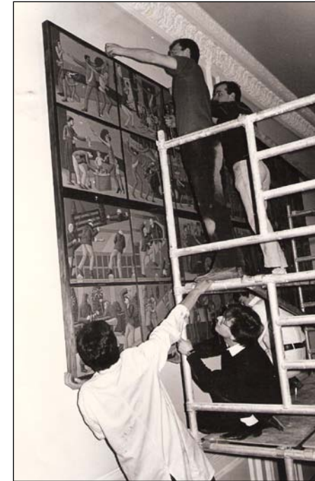
Installation of Michael Anderson's paintings in the mid 1980s. These can be seen in the Wilde Theatre Foyer and outside the Dance Studio.

As the building was arranged over three floors and had nearly 60 rooms conversion was a complicated process. It was divided into two phases. Phase 1 was making the building fit for public use and Phase 2 involved converting the 'safe shell' into a functioning centre. It opened in October 1973 with a range of courses and activities whilst conversion work was still being carried out. Despite dry rot, the national energy crisis and the three-day week all causing delays to the project the terrace bar was opened in June 1974 and by the beginning of 1975 all the general facilities were open (figures 15–17). 32