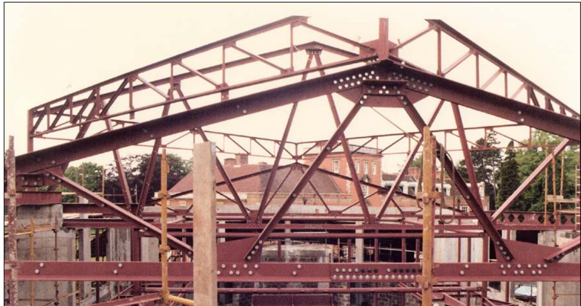
The Wilde Theatre being built (1982–84).