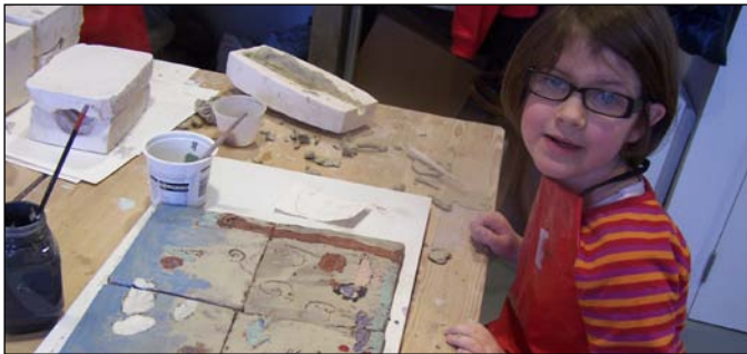
Clay Creations children's course – Ceramics Studio.

These funds allowed the Mansion spaces to re-develop and focus on artistic activity. A new Atrium bar was opened, allowing food and drink to be served alongside art and music performances. The John Nike Suite opened in 2004, allowing digital media to be fully explored.