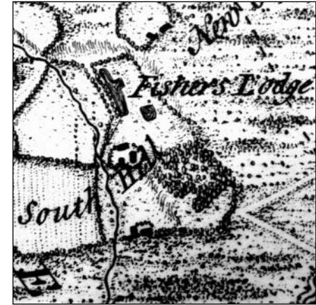
Exhibition figure 2 (detail)