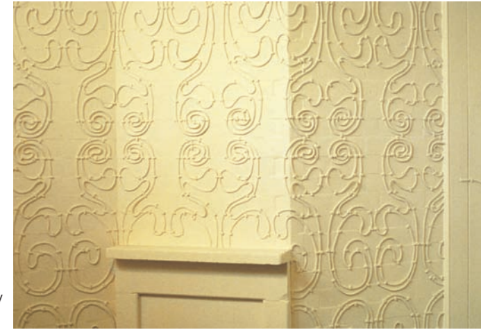
CSKX Studios, London 1992