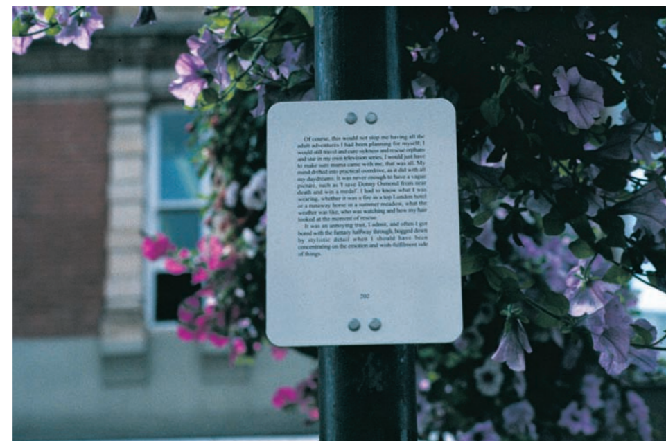
Lampposts from St Matthew's Church through the High Street and into Park Street, Walsall 1999