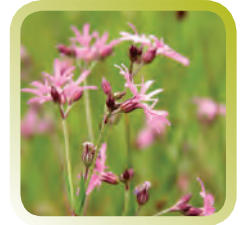
Ragged Robin, Lychnis flos-cuculi