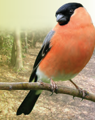
Bullfinch, Pyrrhula pyrrhula

The meadow at Ambarrow Court is full of life during the summer. Wildflowers such as yellow rattle, black knapweed and bird's foot trefoil, provide a colourful floral display. During summer, butterflies such as ringlet, meadow brown, gate keeper and large skipper can be spotted.