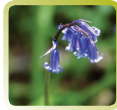
Bluebell, Hyacinthoides non-scripta