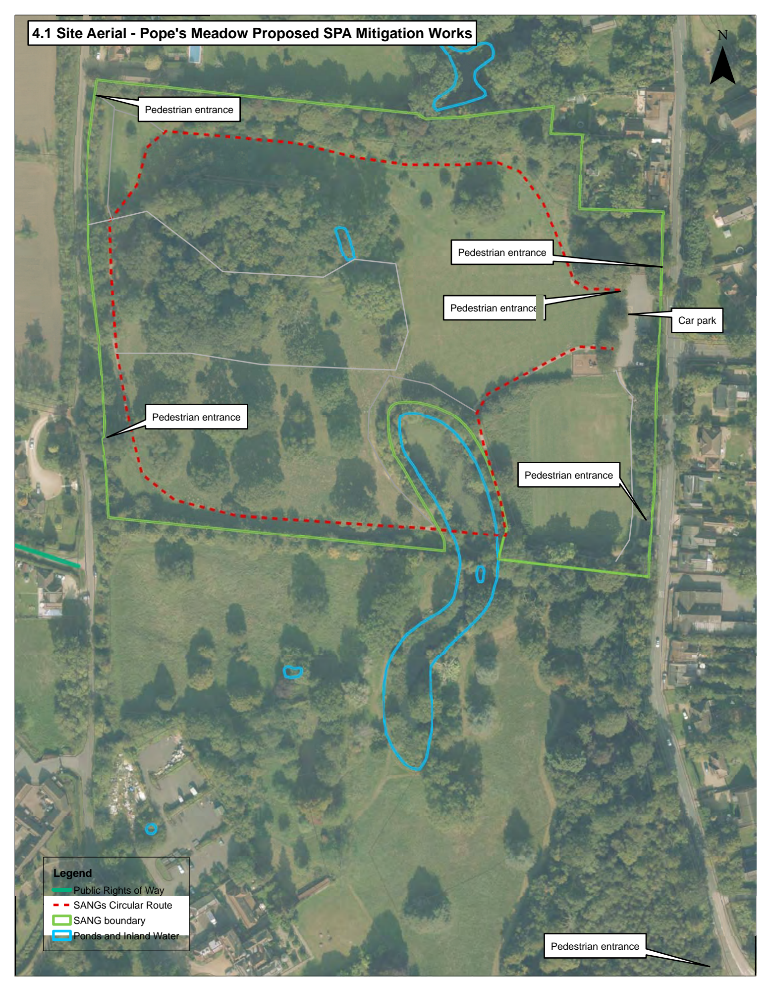
Please note this site plan shows only a selection of the proposed works, refer to section 3 Site Proposals for full details.