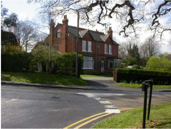
25 New Villas beside Forge Cottage, looking south-west