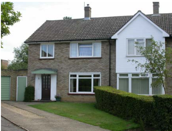
9 Typical house of The Green, looking east