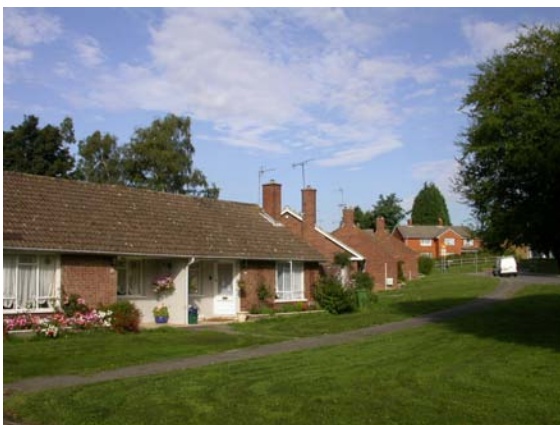
17 Offset gabled houses on Pondmoor Road, looking south-west