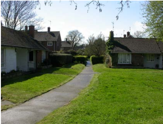
21 Typical path linking 1950s streets, Swancote Green, looking east