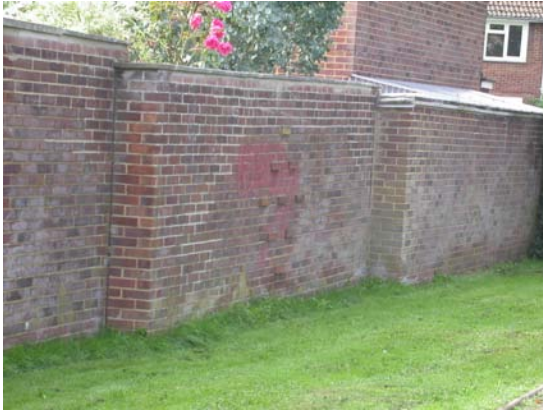
19 Wall with relief bricks along path, parallel to Rectory Lane, looking south