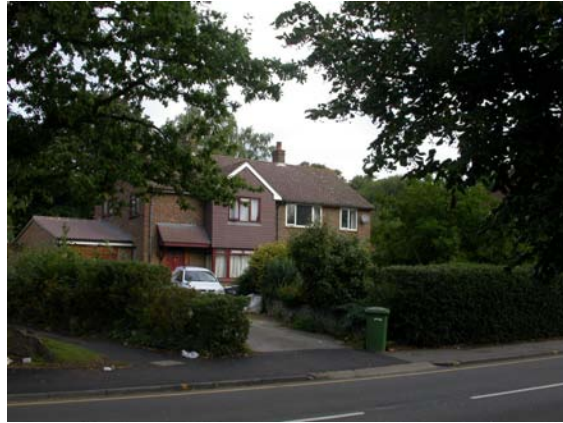
2 House on west side of Rectory Lane, looking north-west