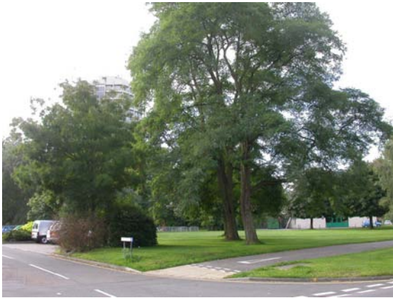
7 North corner of The Green, looking south-east