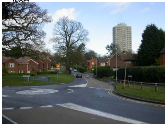
22 Rectory Lane, looking north from junction