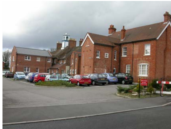
28 Church Hill hospital and almshouses, Reed's Hill, looking north-west