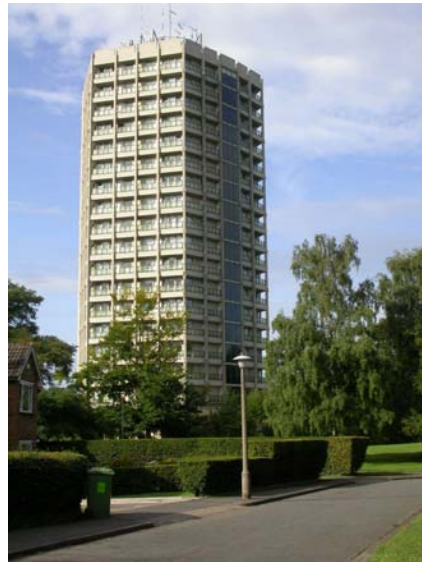
10 Point Royal and street lamp on The Green, looking south-west