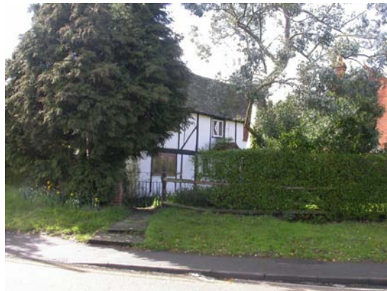
24 Forge Cottage on junction of Rectory Lane and Crowthorne Road, looking south