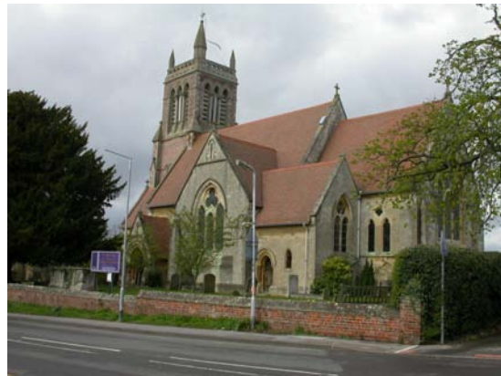
30 St Michael and Mary Magdalene Church, Reed's Hill, looking north-west