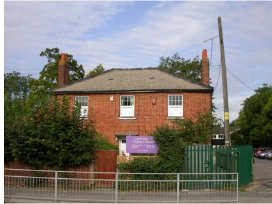
26 St Michael and Mary's Church school, Rectory Lane, looking west