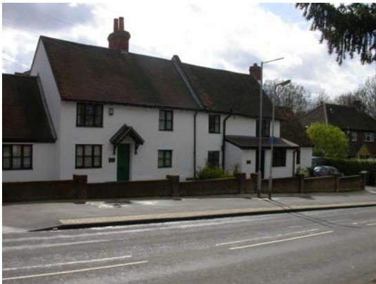
29 Church Cottage and Flax Bourton, Reed's Hill, looking south-west