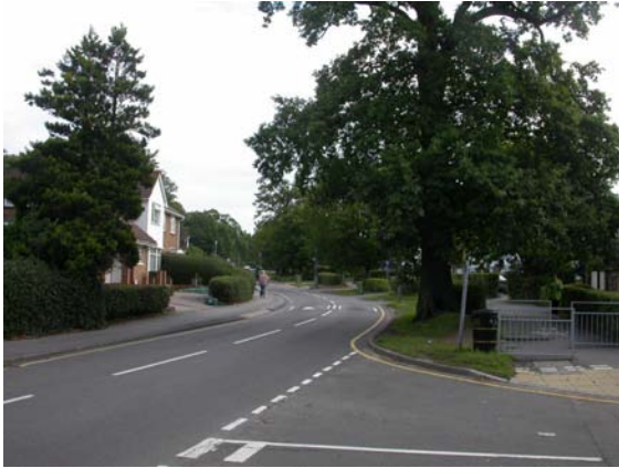
1 North end of Rectory Lane, looking north