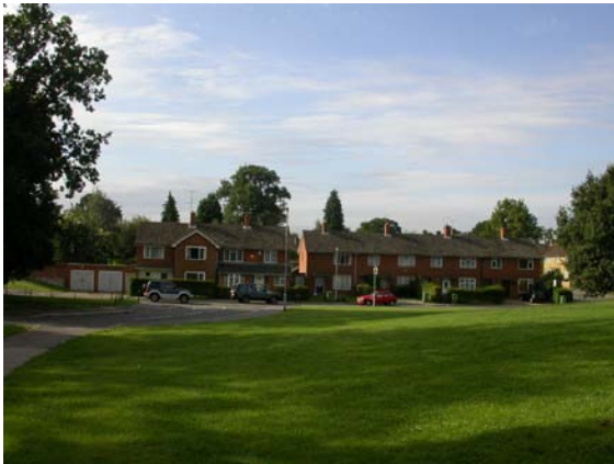
15 Housing along south-east side of The Green, looking south-east