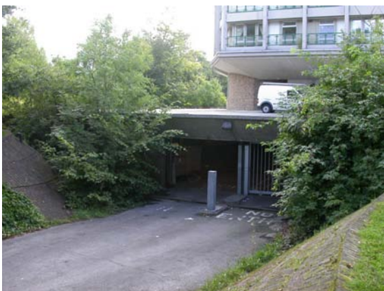
11 Entrance to underground parking of Point Royal, looking east