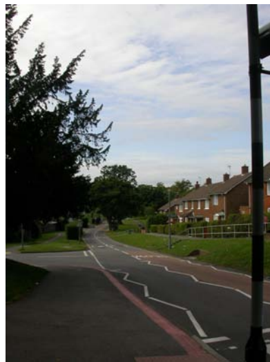
18 Rectory Lane, looking south