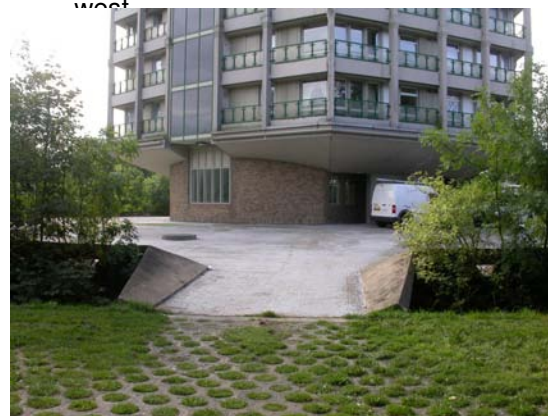
12 Entrance to Point Royal, looking east