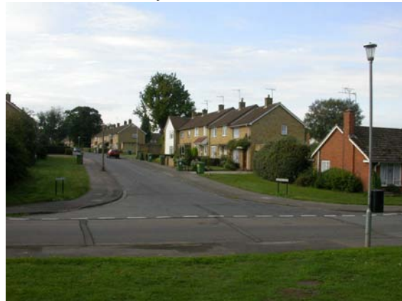
16 Redvers Road, looking south