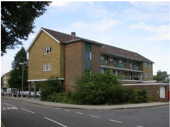
5 Shopping centre, south of crescent of houses, looking south-west