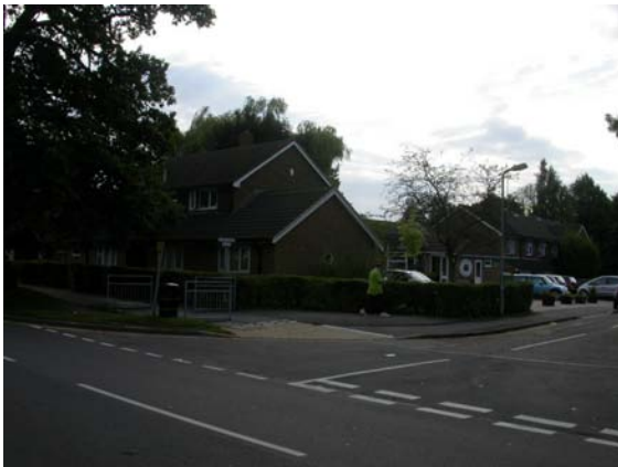
3 Junction of Rectory Lane and The Green, looking north-east