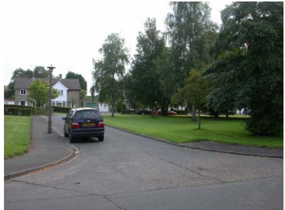
8 The Green houses, looking east