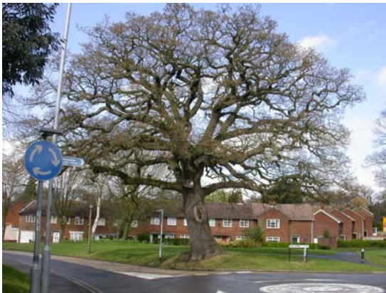
23 Oak tree on junction of Rectory Lane and Crowthorne Road, looking north