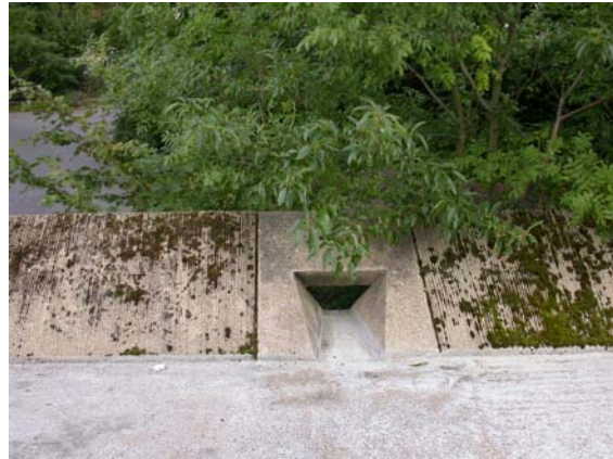
14 Chamfered gutter-slot set in rampart around Point Royal