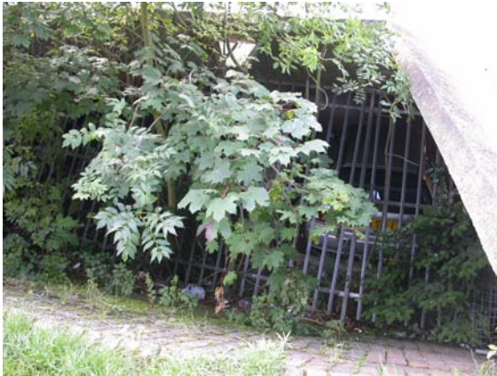
13 Grilles of underground parking