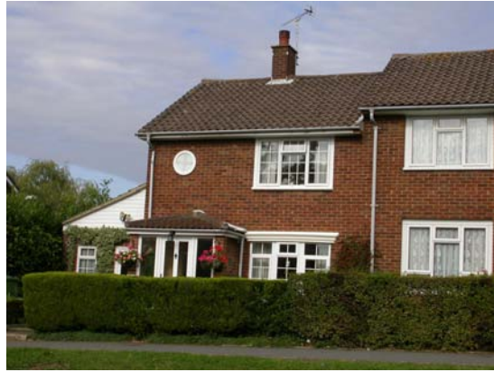
20 Housing on east side of Rectory Lane, opposite Swancote Lane, looking west