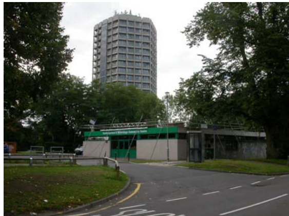
6 Community centre and Point Royal, looking south-east

Plates 1-6 Views of the north-east of Rectory Lane