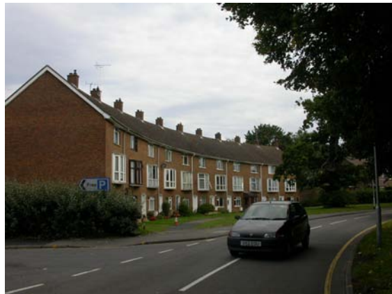
4 Crescent of houses on west side of Rectory Lane, looking north-west