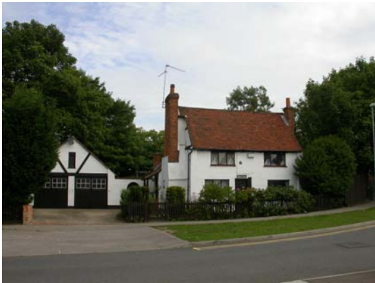
27 White Cottage, on the corner of Rectory Lane and Reed's Hill, looking north