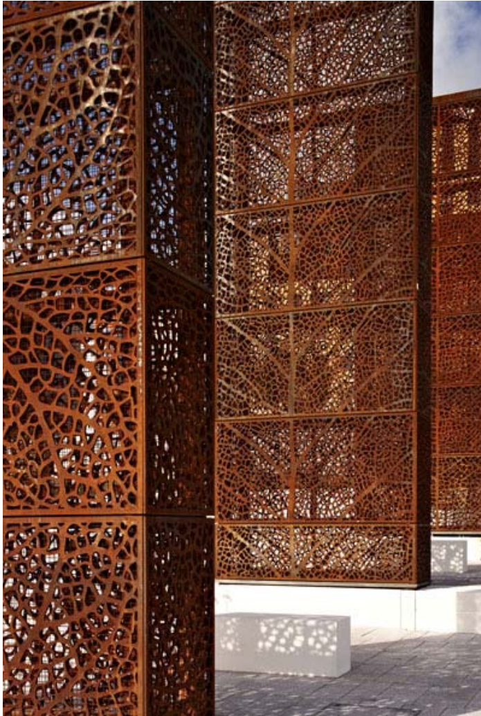
Photo 8 – Corten steel trees which could form part of the gateways into the town centre