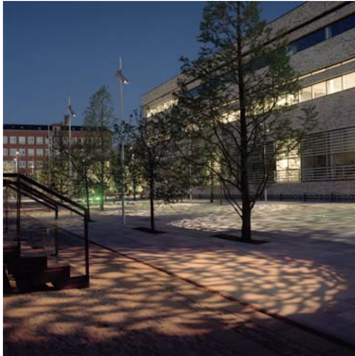
Photo 9 – lighting effects as public art within public spaces or nodes

9.16 In all these instances, the lighting of the exterior of buildings would need to be considered to provide an appropriate backdrop to the activity within. This is particularly true for the historic buildings which are to be retained as part of the redevelopment. The Town Centre Lighting Strategy will illustrate how this can be best accomplished throughout the centre.