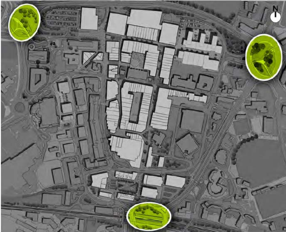
Map 1 – town centre gateways