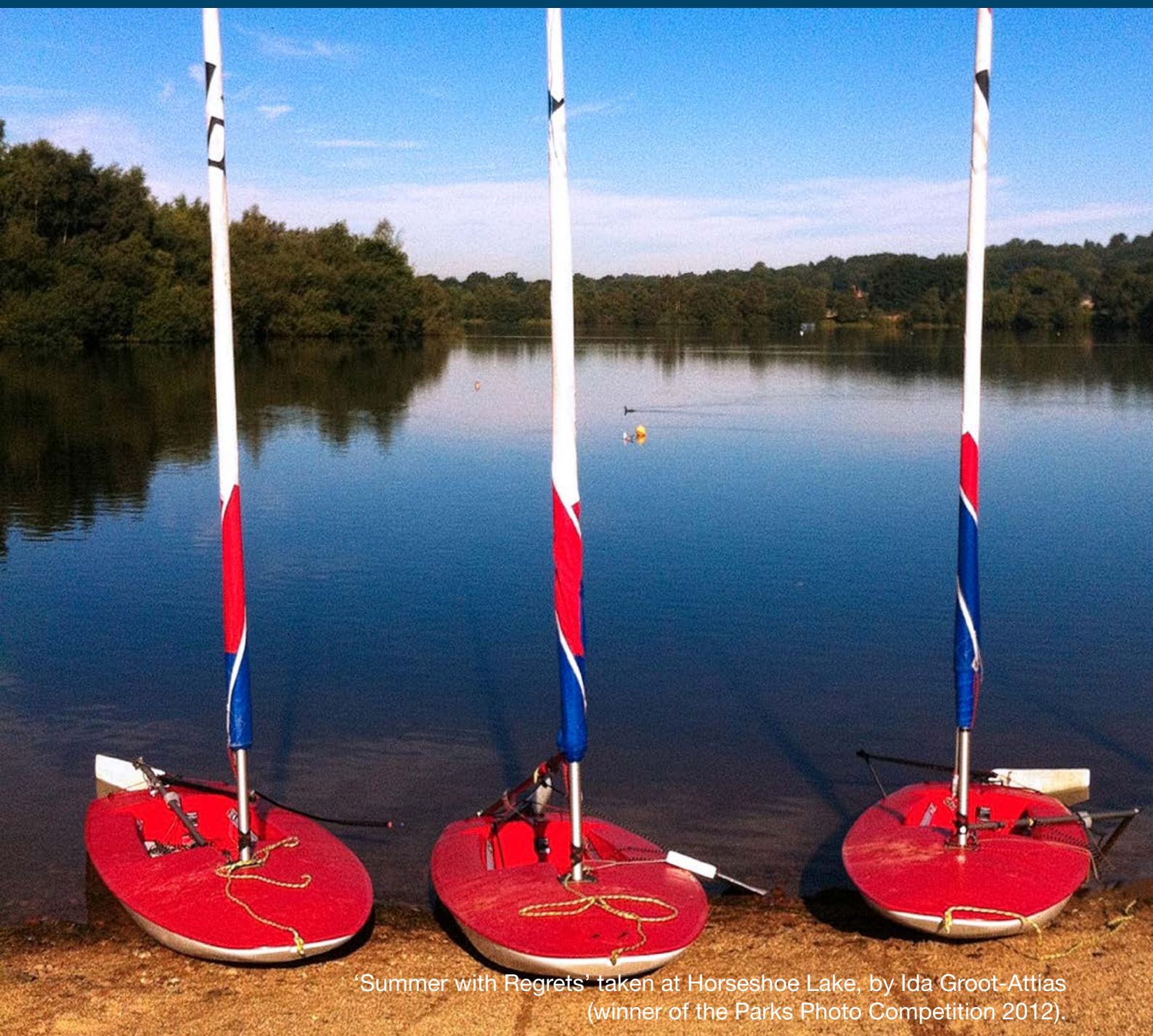
'Summer with Regrets' taken at Horseshoe Lake, by Ida Groot-Attias (winner of the Parks Photo Competition 2012).