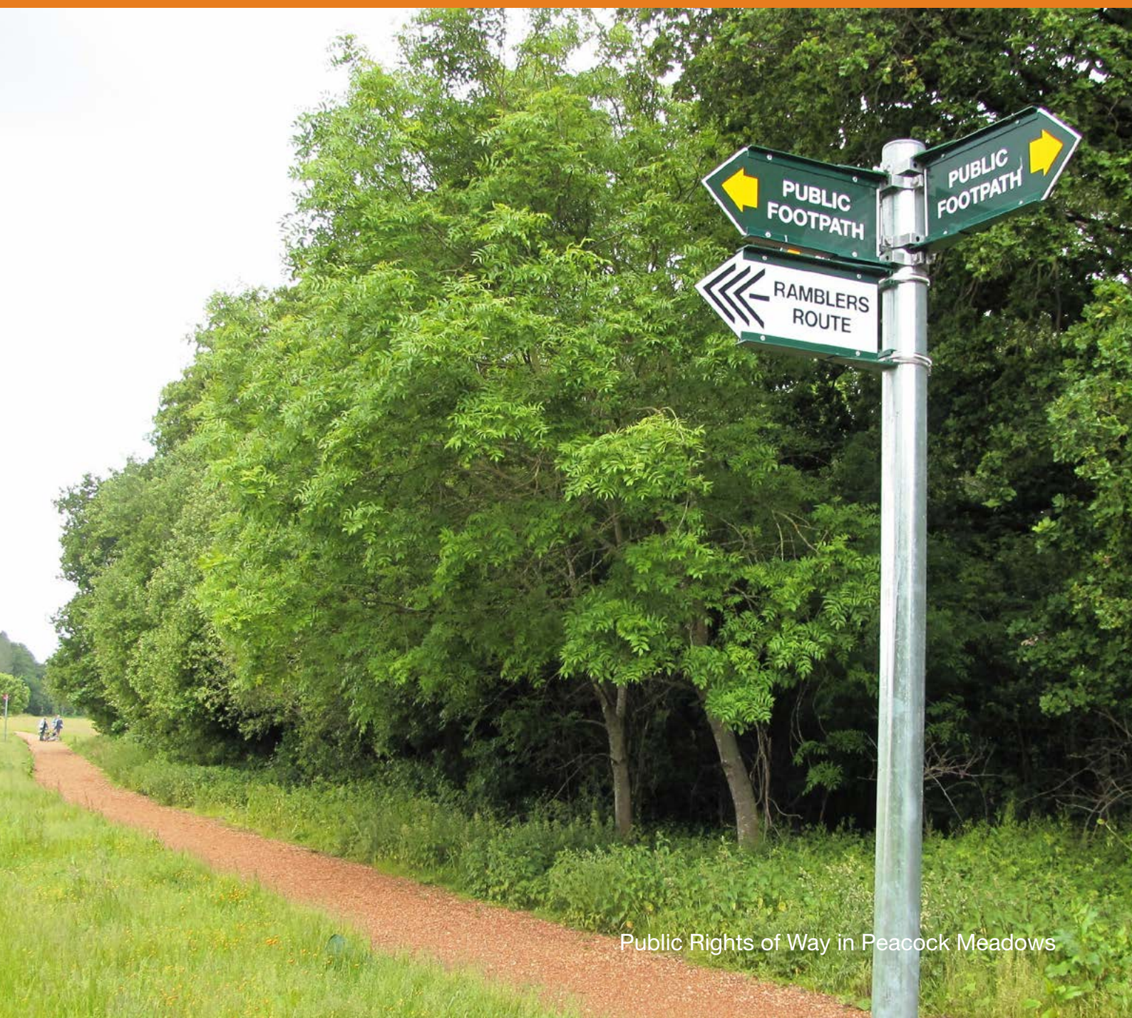
Public Rights of Way in Peacock Meadows