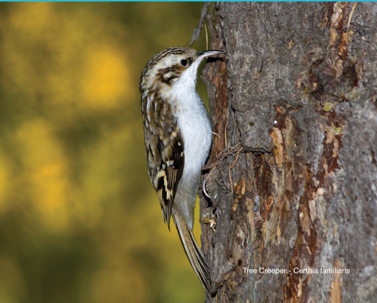
Tree Creeper - Certhia familiaris