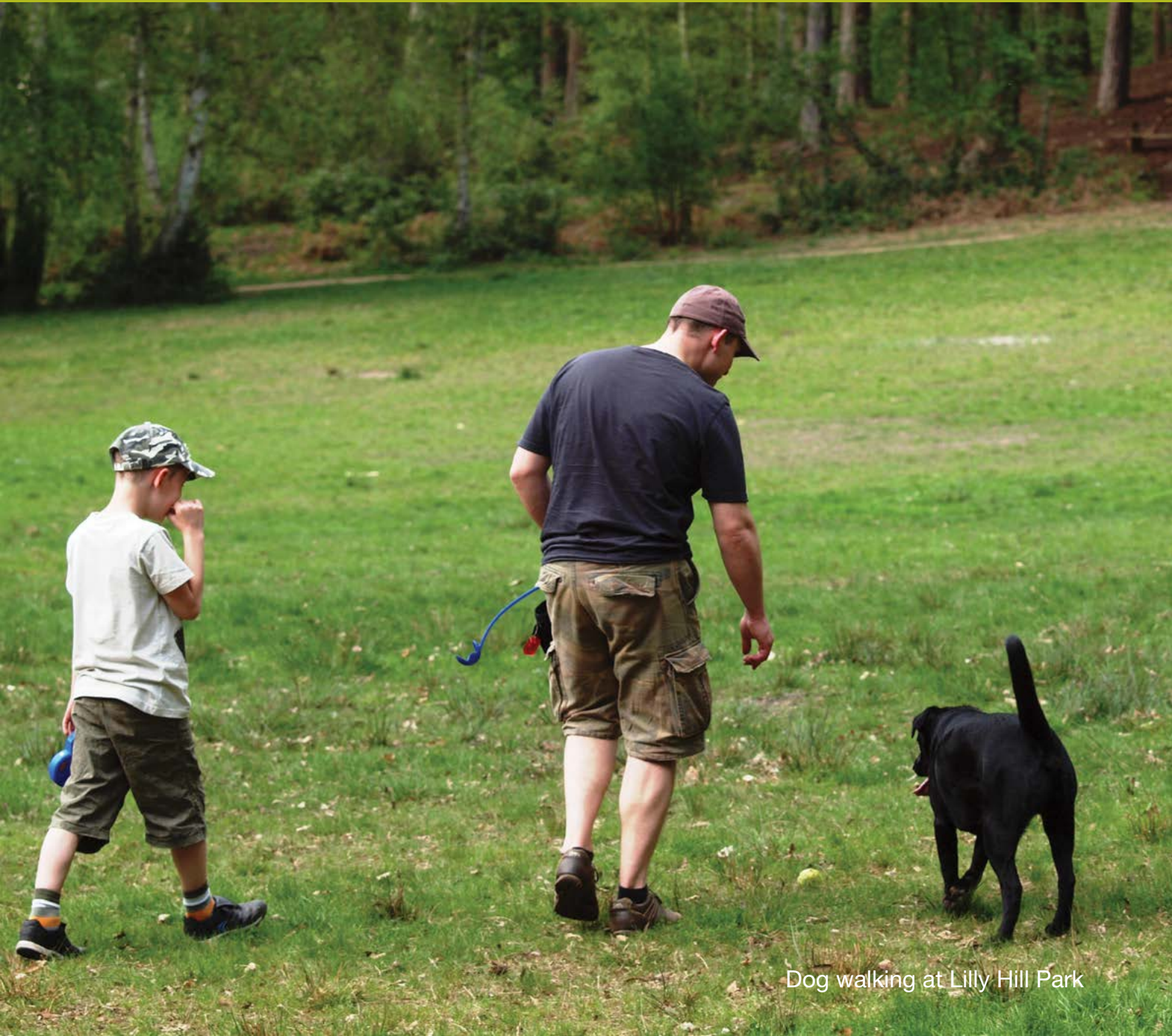
Dog walking at Lilly Hill Park