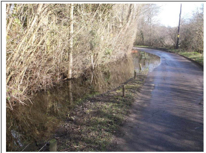
Figure 5: Flooded ditch

Figure 5 shows an example of how flooding occurs if a Riparian owner fails to maintain their section of a ditch/culvert. It can have devastating consequences up