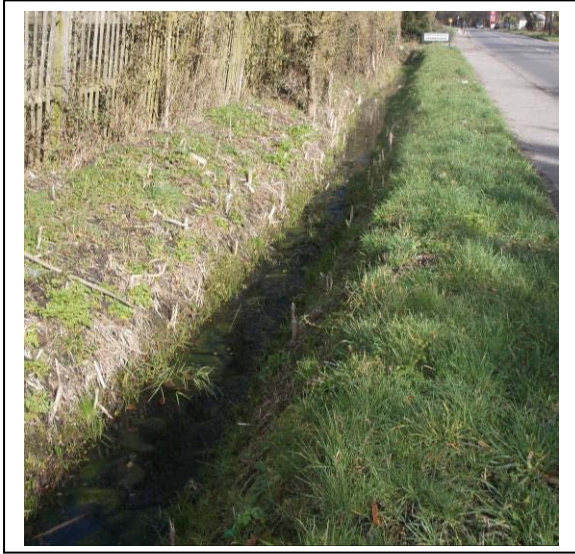
Figure 2 shows a ditch running between the Public highway and a field. The riparian owner of this ditch is the owner of the field. They are required to maintain the whole ditch and ensure they meet their riparian responsibilities (see below).