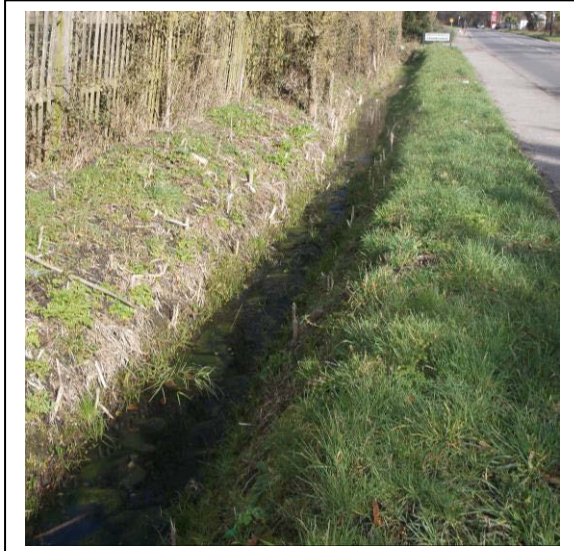
Figure 4 shows an example of a well maintained ditch.

This is a free flowing ditch and clear of any obstruction. It is also deep enough to accept water from upstream during times of increase rainfall.