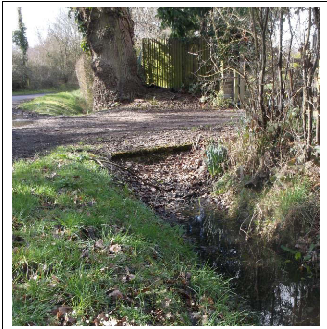
Figure 3 shows a ditch running between the Public highway, a property and under an access way (drive way). The riparian owner of this ditch and culvert (this is an area of ditch which has been piped) is the owner of the property next to the ditch. They are required to maintain the whole ditch, including the culvert under the driveway and to ensure they meet their riparian responsibilities (see below). If the driveway gives access to more than one property the riparian owner may wish to approach them to assist with the maintenance of the culvert.

As you can see by figure 3 the culvert is blocked and the water in the ditch is not able to flow. This may lead to flooding in the immediate area and further upstream.