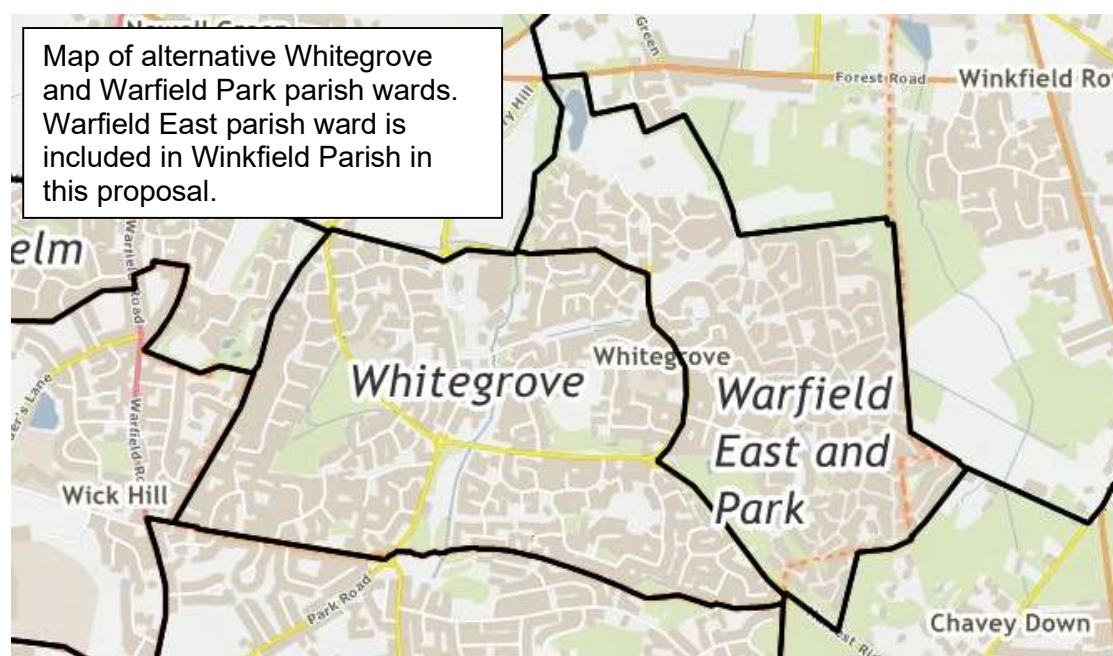
Fig 2: - Councillor/ Elector summary for alternative proposal – Warfield Parish