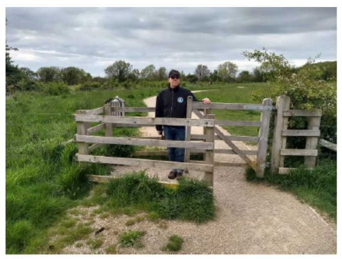
1 Typical accessible gates at Cabbage Hill

Members captured some photos of the stages of the route on their site visit, which are shared below. A draft map and text are being drawn up by Bracknell Forest Council. When a draft is ready, it will be checked and approved by LCAF members, before being provided on BFCs website.