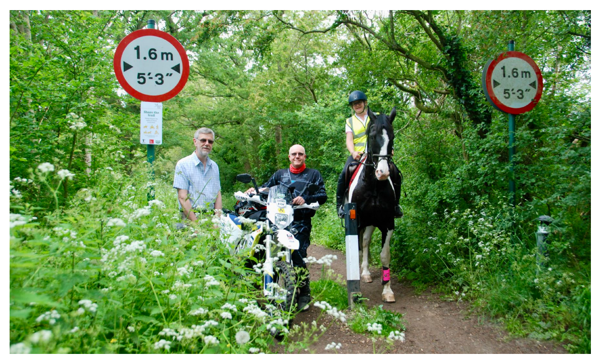
LCAF members at the Share the trail sign unveiling. See update under 6.2

LCAF operates in line with the <u>Local Access Forums (England) Regulations 2007</u> and our <u>agreed terms of reference</u>.