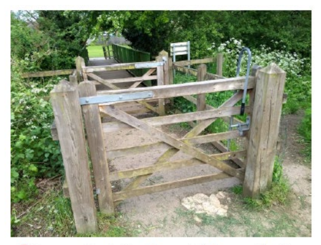
5 Access to Garth Meadows at bridge over The Cut from Anneforde Green. This was the only place where opening the gate could be difficult for a wheelchair user especially coming from the bridge.