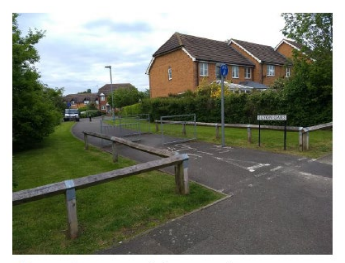
4 Route from Lyon Oaks into Kennel Lane