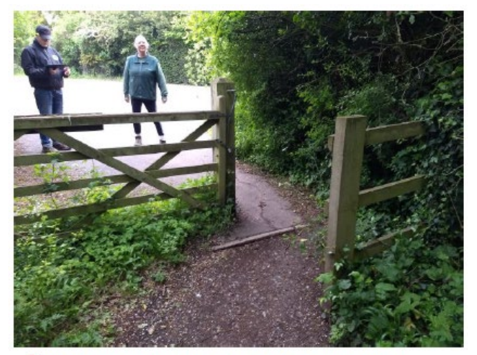
2 Exit from Quelm Lane (North) to Harvest Ride