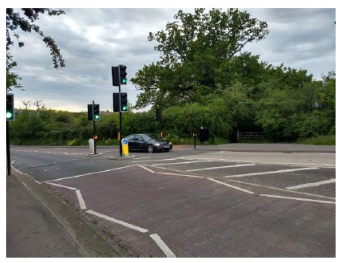
3 Quelm Lane crossing on Harvest Ride (looking North)