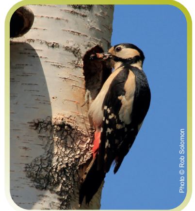
Great-spotted woodpecker, dendrocopos major