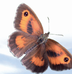
Gatekeeper butterfly, Pyronia tithonus

Contains a small woodland on top of a small hill with several informal paths providing access throughout.