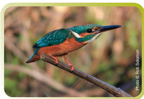
Kingfisher, Alcedo Atthis