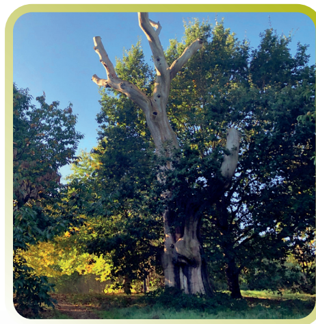
Veteran sweet chestnut tree, Castanea sativa

Contains a wildflower meadow, with scattered oak trees, small thickets and ponds. A viewing platform is available at the larger pond, known as Rachel's Lake, which is thought to be named after one of John Walsh's mistresses.