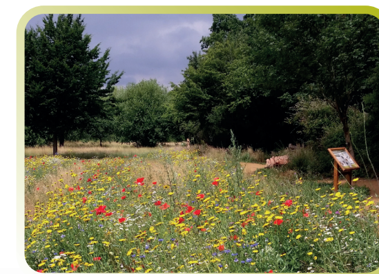
Edmund's Green wildflowers