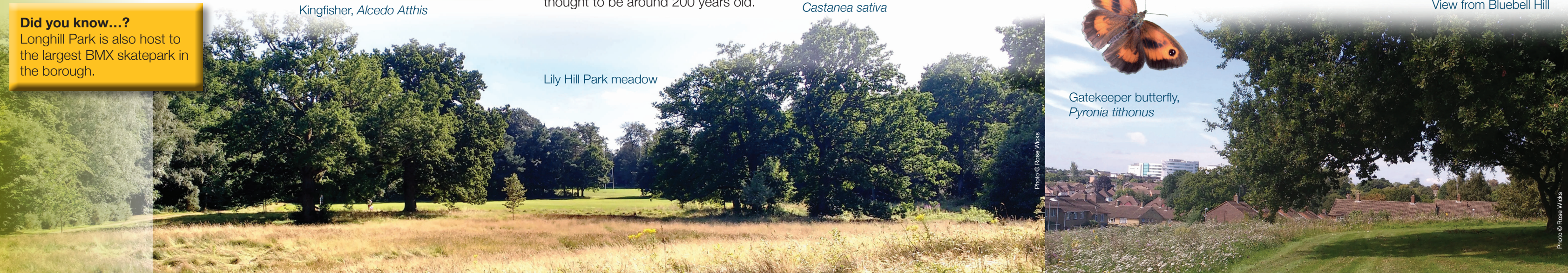
Lily Hill Park meadow