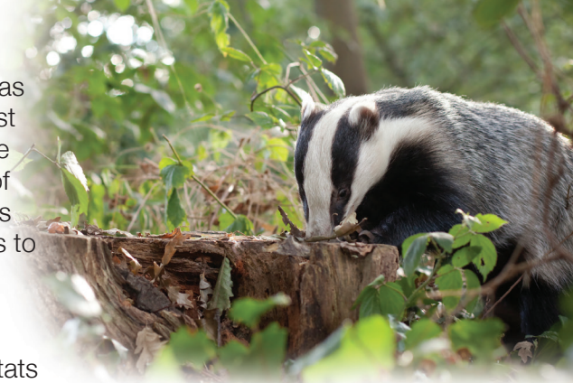
Badger, Meles meles