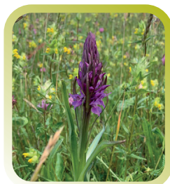
Southern-marsh orchid, Dactylorhiza praetermissa