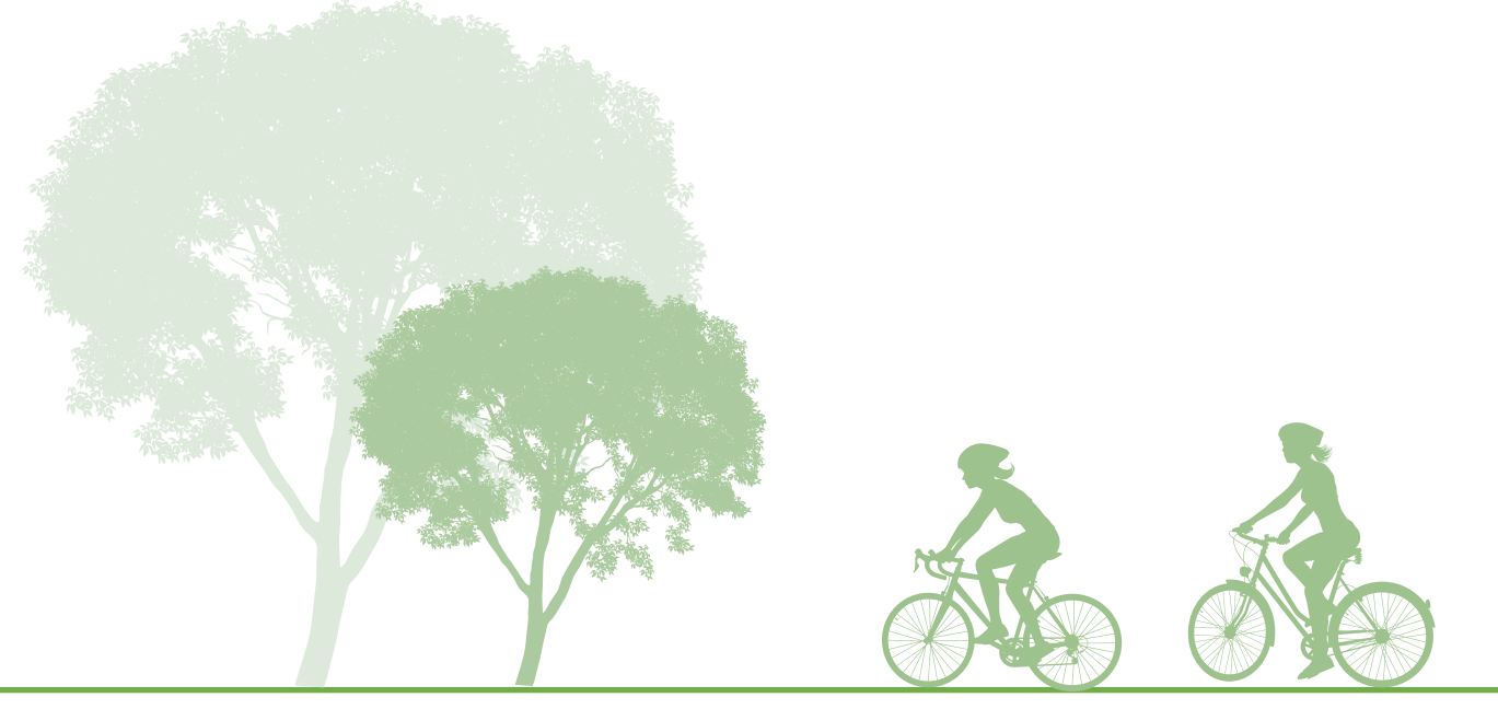
Education Transport Policy for Bracknell Forest Children aged 5 to 16 • 7

Eligibility is needs based - there is no automatic entitlement to Travel Assistance just because a young person has a Special Educational Need or Disability, even where an Education and Health Care Plan (EHCP) has been issued. Applications will be considered on a case-by-case basis, and regularly reviewed, considering the child's Special Educational Needs and/or Disability, mobility or medical needs, as well as any exceptional circumstances.