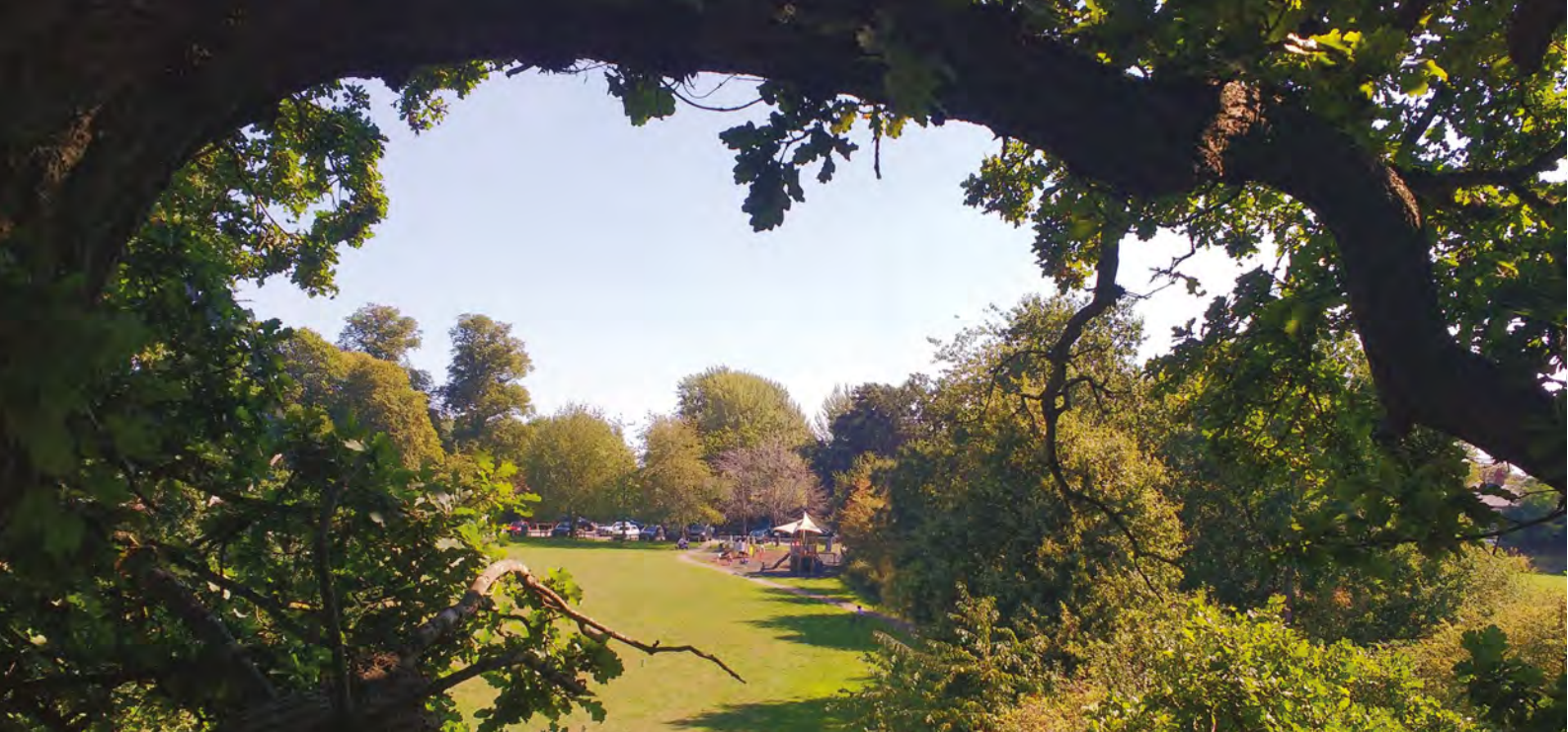
View from the tree tops at Pope's Meadow Big Tree Climb event