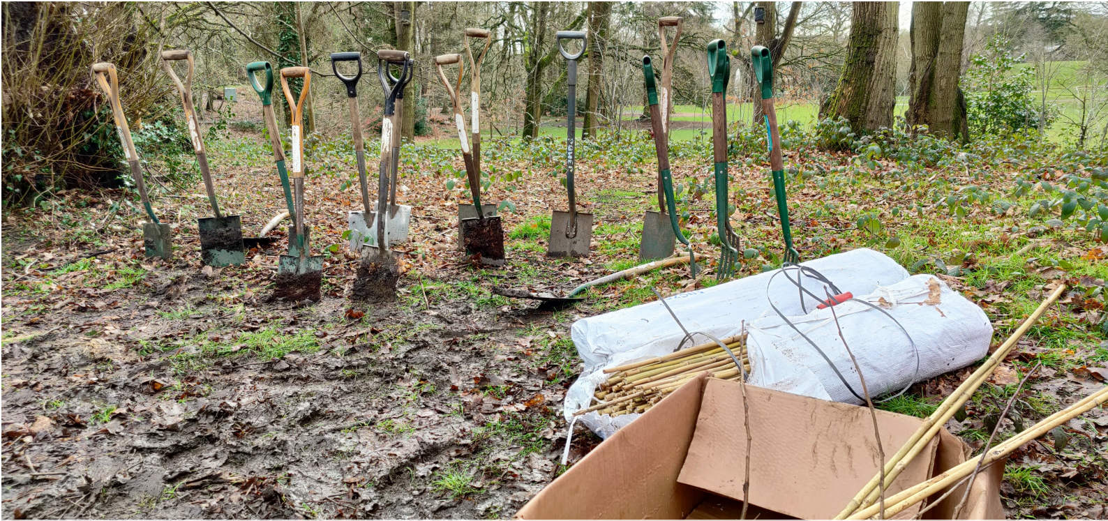
Tree planting at South Hill Park, Bracknell