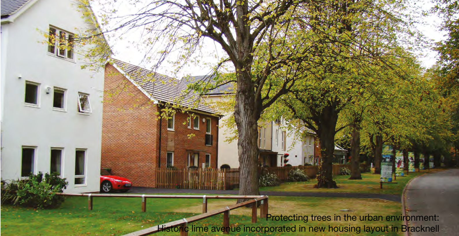
Protecting trees in the urban environment: Historic lime avenue incorporated in new housing layout in Bracknell