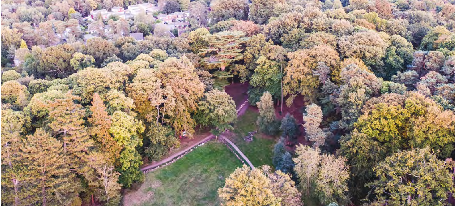
Drone footage over Lily Hill Park, facing north east towards Chavey Down and North Ascot