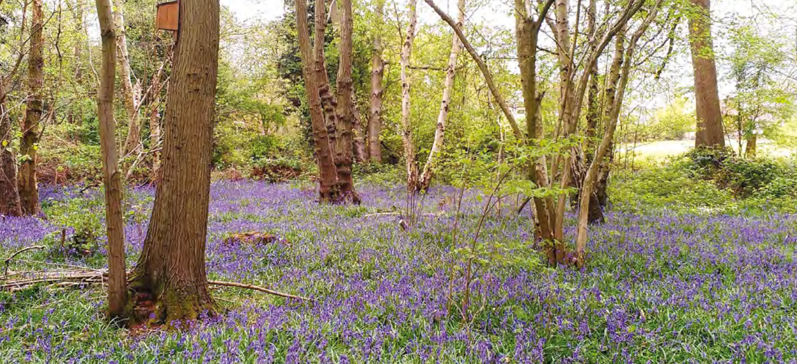
A Carpet of bluebells at West Garden Copse in Bracknell