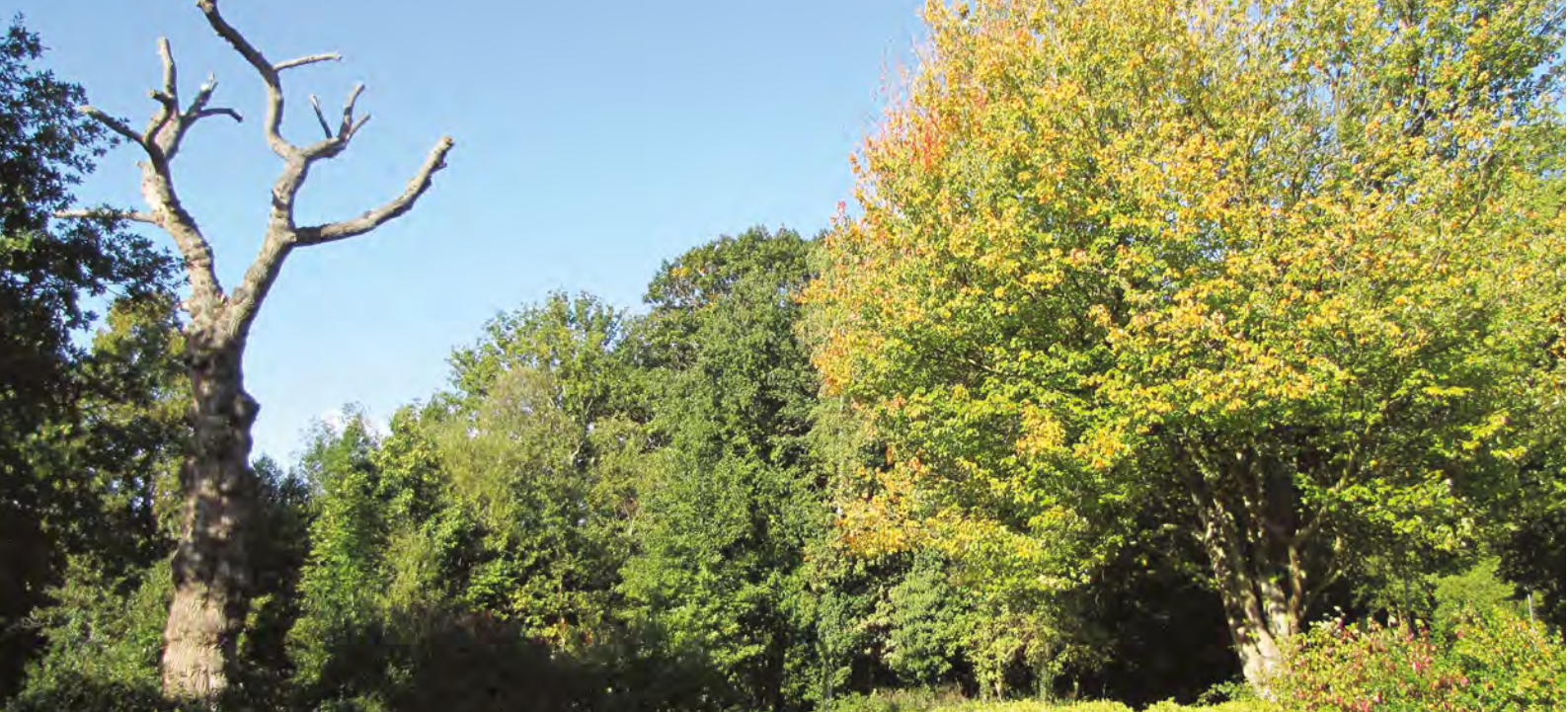
Feature trees and standing deadwood at Snaprails Park in Sandhurst