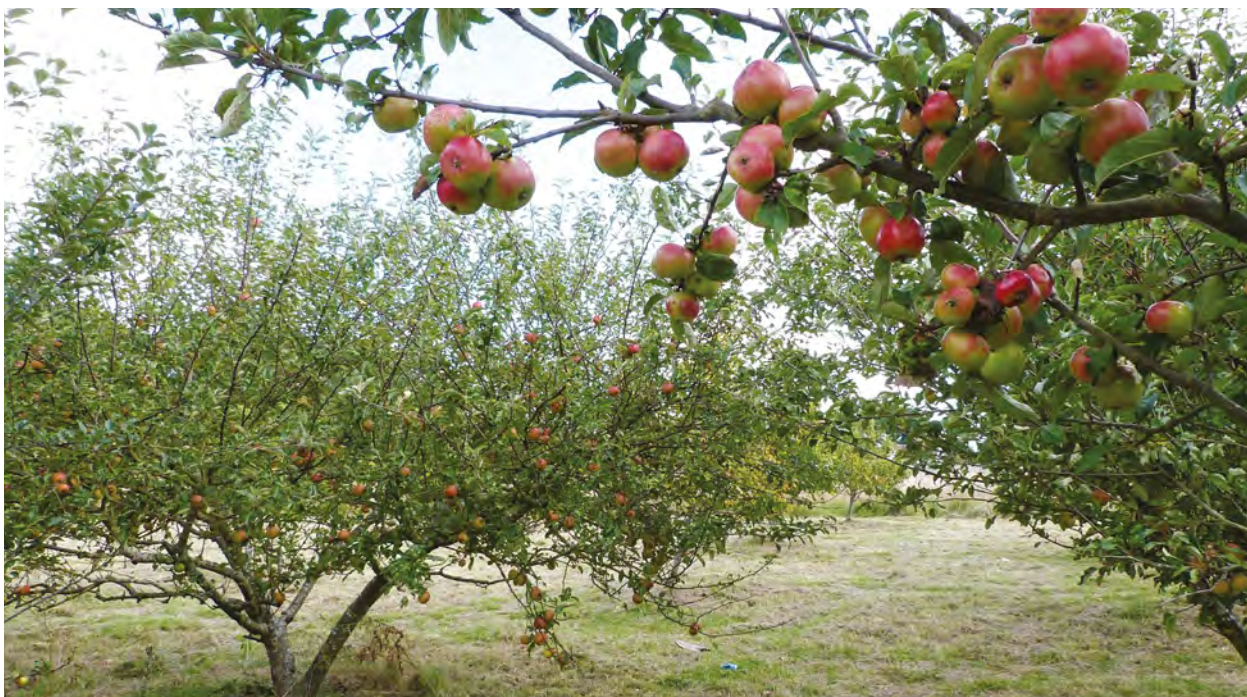
Community orchard at Larks Hill in Warfield

At a national and local level, our wildlife continues to decline and nature conservation must focus on restoring areas across the landscape. Our natural environment is under threat and it is important that we ensure that trees, hedgerows, orchards and woodland can continue to support a wealth of wildlife.