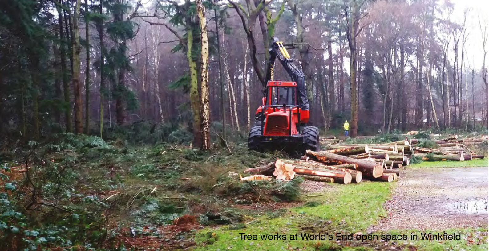
Tree works at World's End open space in Winkfield