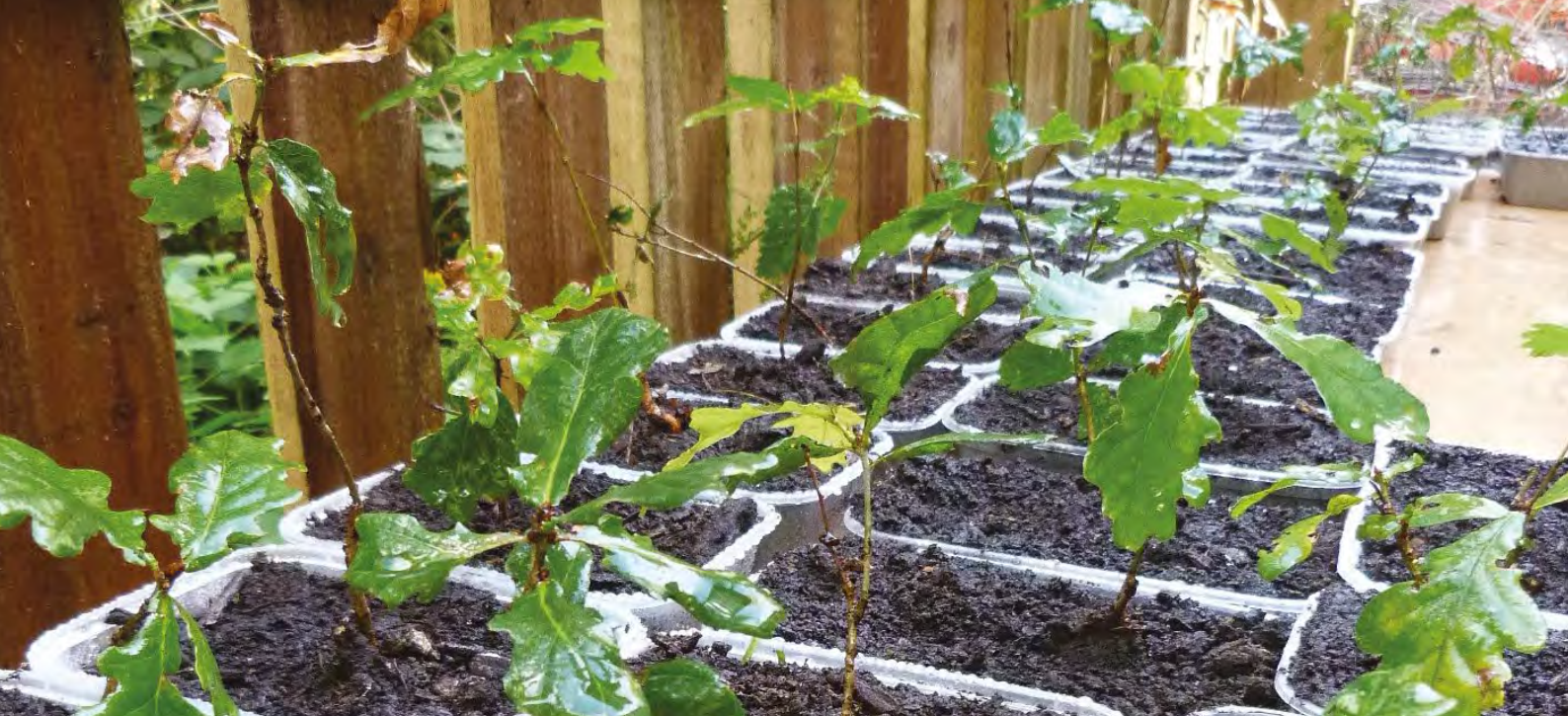
Growing oak seedlings, our future tree stock, at Lily Hill Park in Bracknell