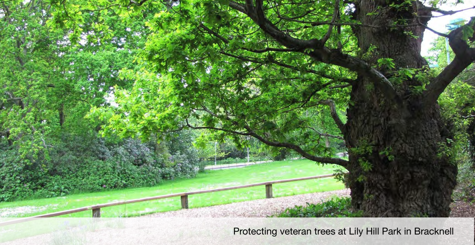
Protecting veteran trees at Lily Hill Park in Bracknell