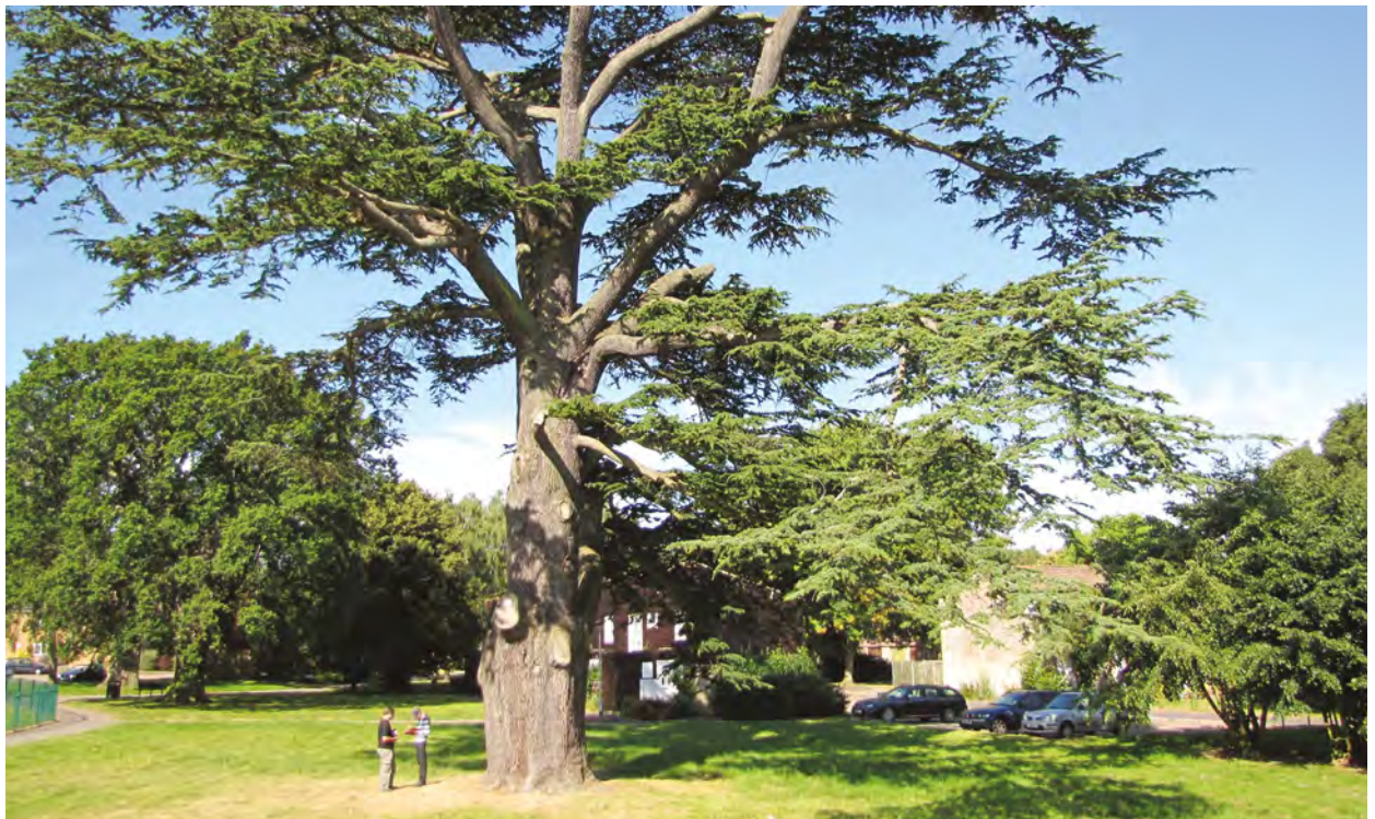
Cedar of Lebanon at South Hill Park

Our Climate Change Action Plan for Bracknell Forest was published in 2013. The plan identifies actions that Bracknell Forest Council can take in which trees play a vital role (see Appendix 2).