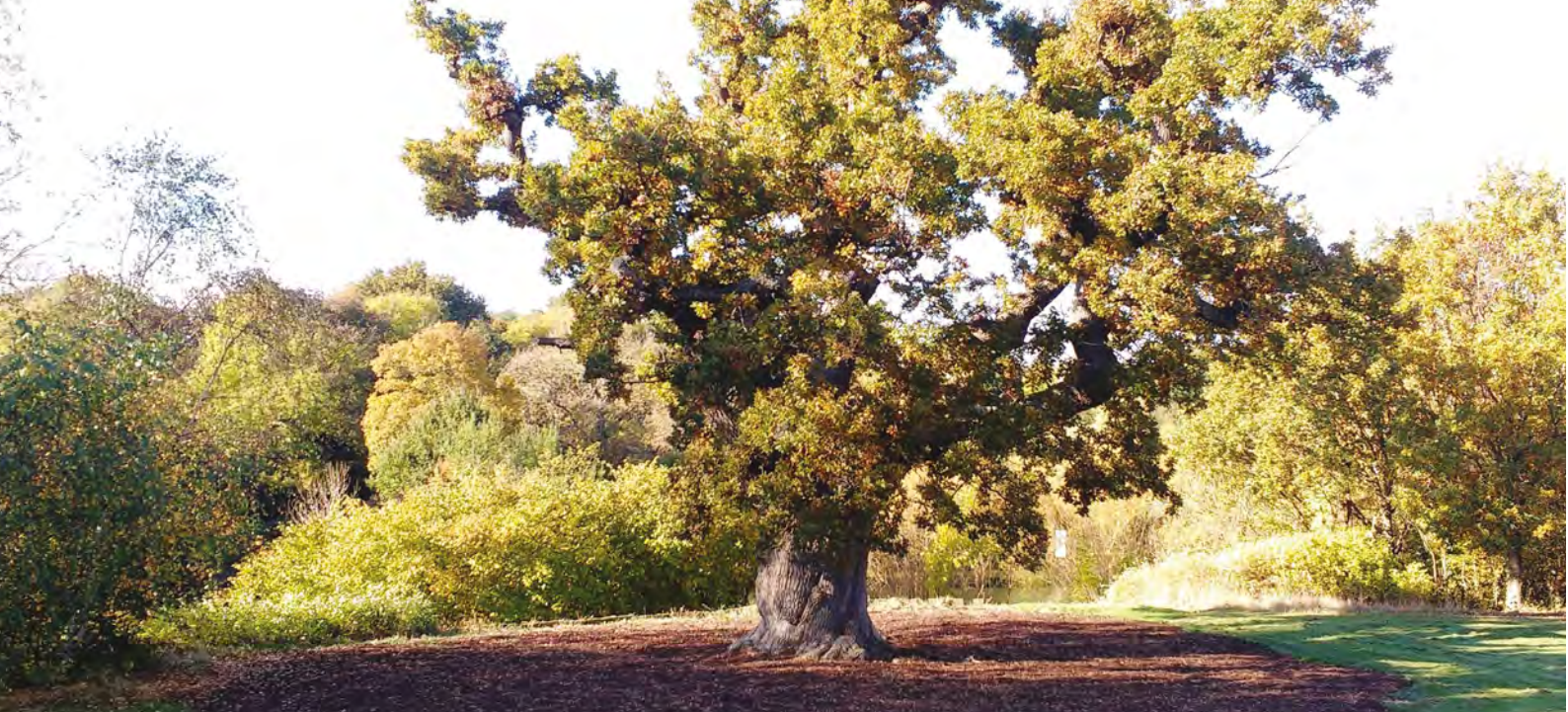
Veteran Oak at Westmorland Park in Warfield