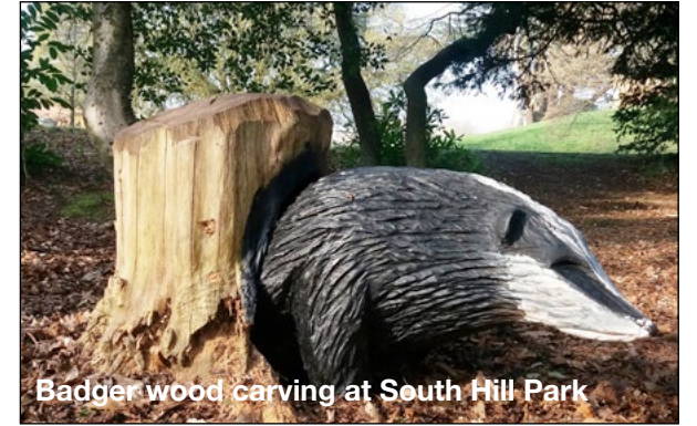
Badger wood carving at South Hill Park

Meet: Courtyard in front of SHP reception, South Hill Park, Ringmead, Bracknell, RG12 7PA.