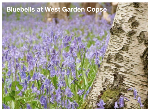
Bluebells at West Garden Copse

All events are free unless otherwise stated.