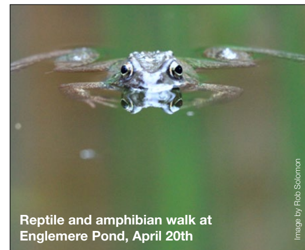
Reptile and amphibian walk at Englemere Pond, April 20th

Information about walking, cycling, orienteering, fishing and horse riding opportunities in the borough is also available on our website www.bracknell-forest.gov.uk/parks-and-countryside/outdoor-activities