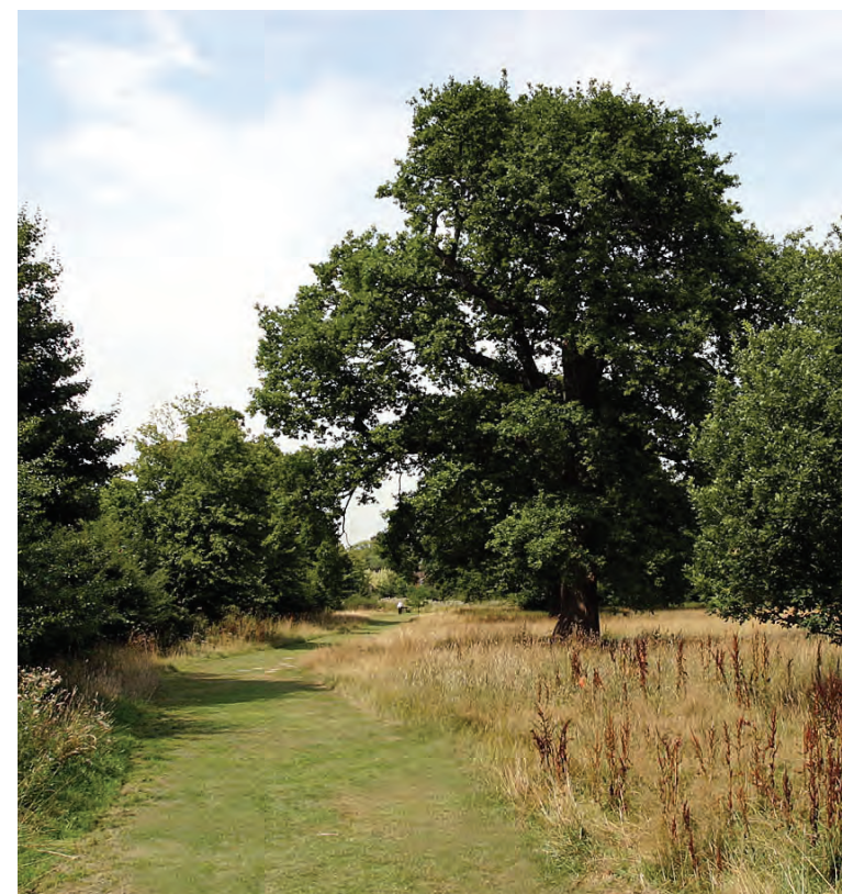
A countryside park in Binfield, Bracknell Forest.