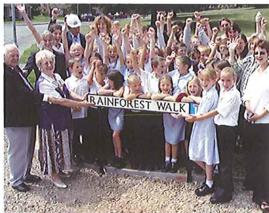
Students from Fox Hill Primary School re-named Rainforest Walk

'Air Wave' acrylic and light wall, 2004, Esther Rolinson Detail of 'Air Wave' acrylic and light wall, 2004, Esther Rolinson