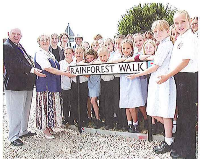
Students from Foxhill Primary School re-named Rainforest Walk

Design for landscape for Rainforest Walk, LB Landscape Architecture